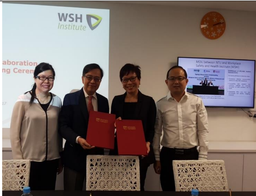
Research collaboration agreement signed on 6 Jan 2017 to deepen understanding on industry ownership of workplace safety and health.